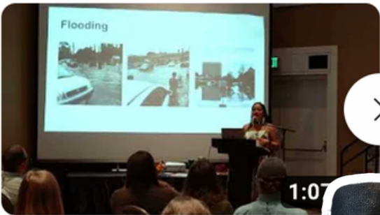
Nourishing Our Future: Sustaining Local Food and...