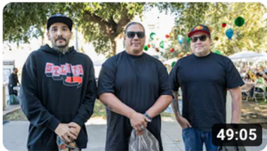
Opening Ceremony | 2023 Annual Gathering — Kinship