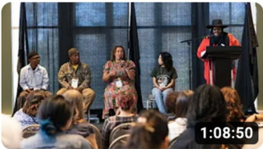
Cultivating the Next Generation of Food System...