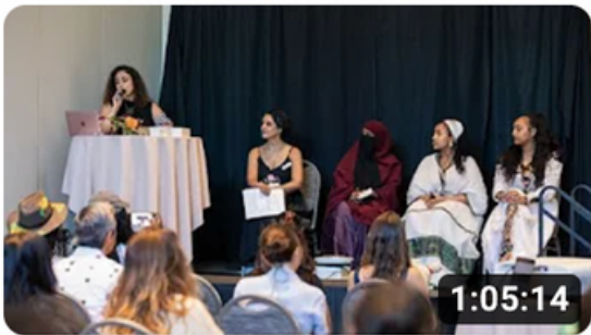
Food to Remember: Recreating Identity in...